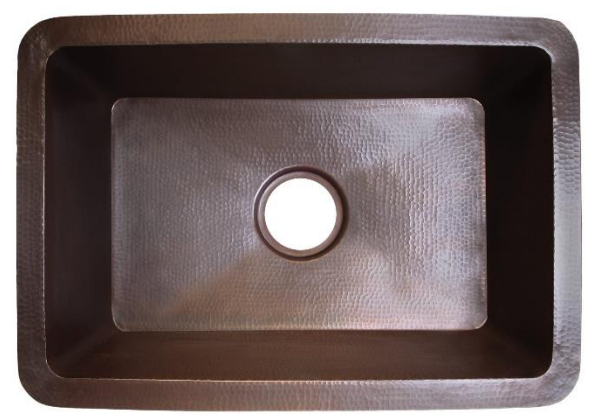
Shown in DB